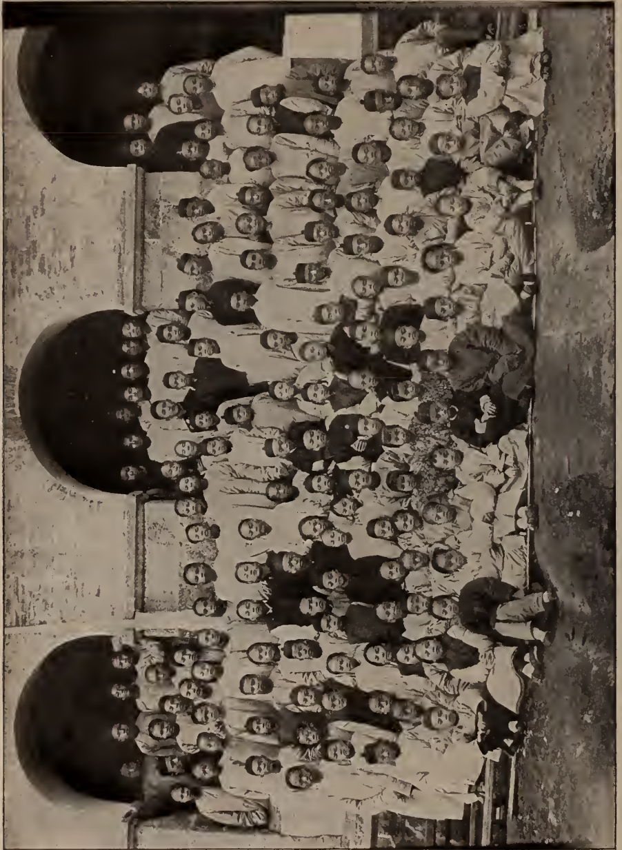
FOOCHOW COLLEGE STUDENTS.